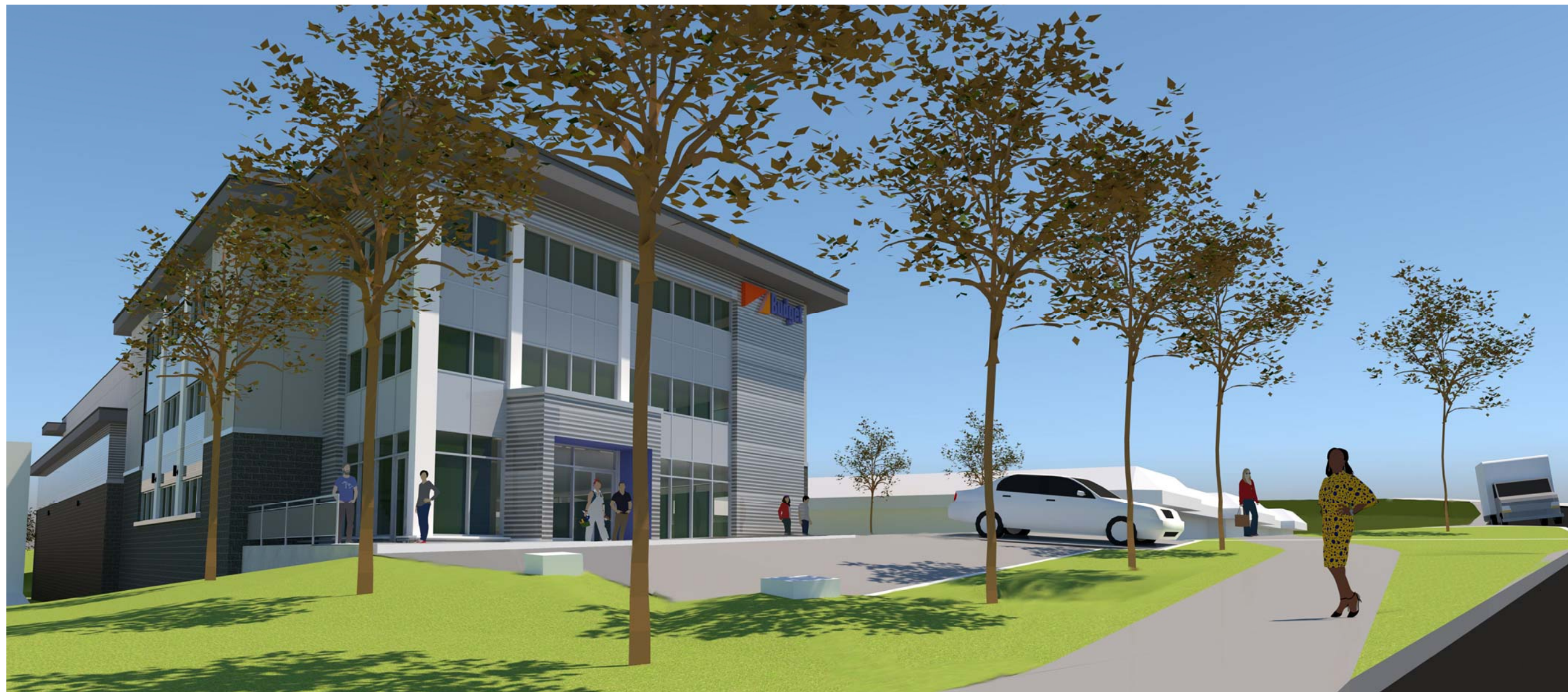
3 VIEW FROM NORTH-WEST