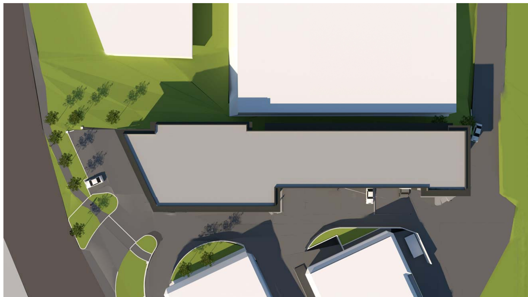
5 SEPTEMBER 21 @ 2pm