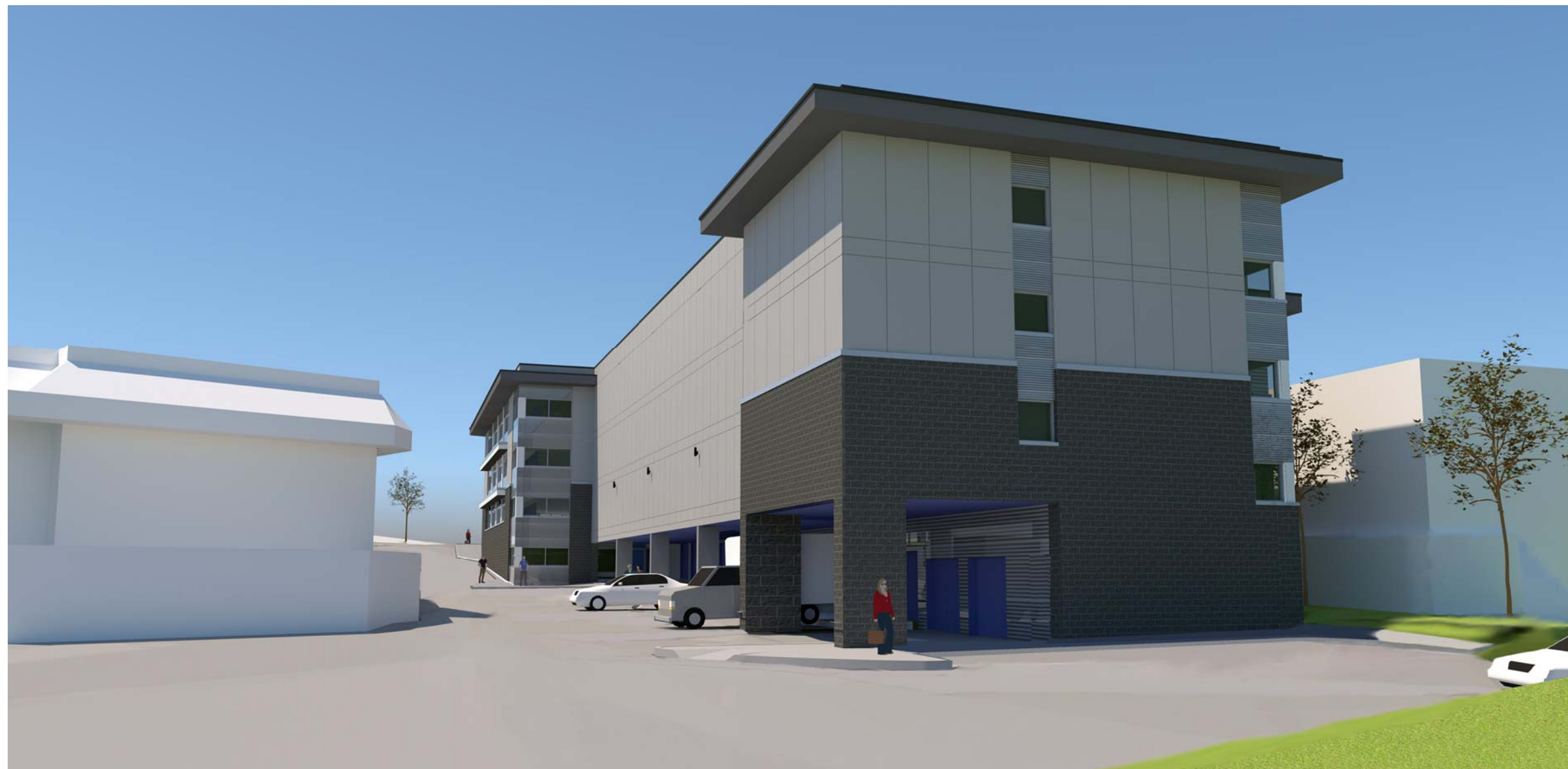
4 VIEW FROM NORTH-EAST