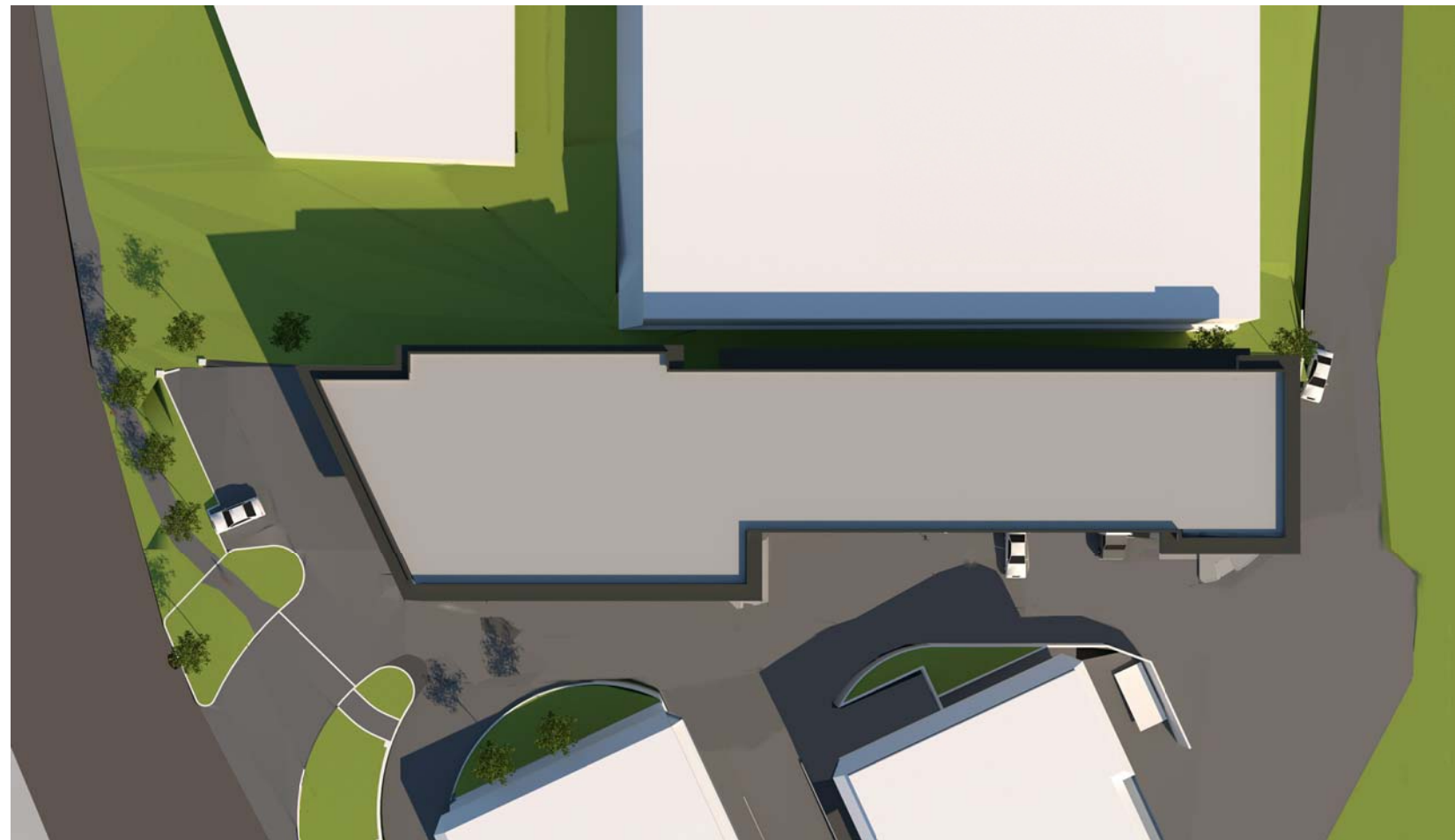
7 SEPTMEBR 21 @ 10am