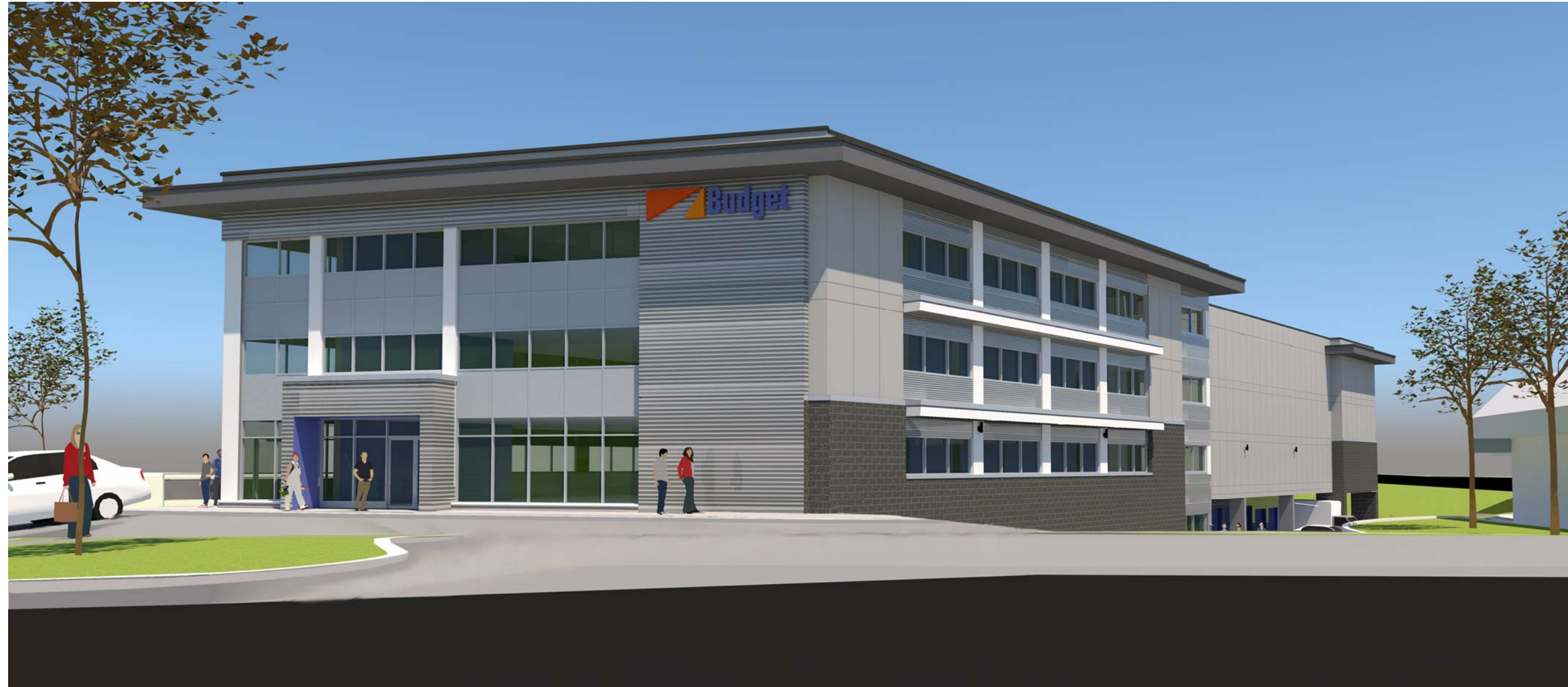
1 VIEW FROM SOUTH-WEST